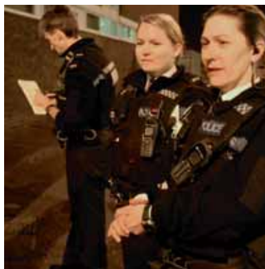
DORSET SPECIALS MAKE AN IMPACT ON ANTI-SOCIAL BEHAVIOUR

"We have the skills to support major events where public order is paramount"