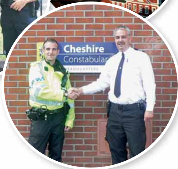
CENTRE ROW LEFT: GETTING TOGETHER - VISITORS FROM NORTH YORKSHIRE SPECIAL CONSTABULARY WITH REPRESENTATIVES OF CHESHIRE SPECIAL CONSTABULARY