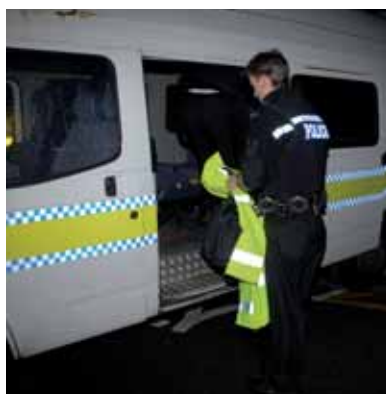
ON PATROL IN POOLE WITH DORSET SPECIALS AS PART OF OPERATION VENUS